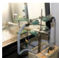
KI DISCUSS TEST

Each Faster vertical and horizontal laminar flow cabinet is tested in accordance to ISO 14644-1 and EN 61010:2001 Standards and released with FAT certificate of the tests performed.