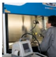
FILTER LEAKAGE TEST