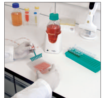
Removal of washing solutions