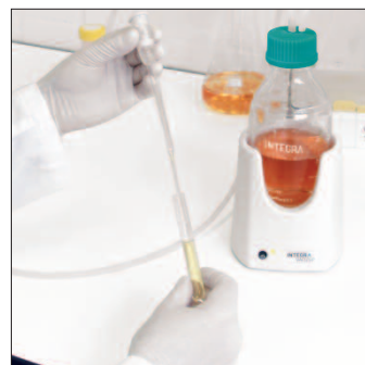
Supernatant removal to harvest bacteria