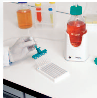
Aspiration from Western blot strips