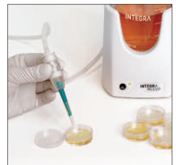
Removal of culture media