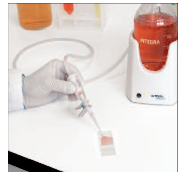
Removal of excess liquid from object slides