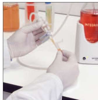
Aspiration of supernatants