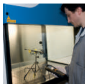
AIR FLOW SPEED TEST

Each Faster cabinet is tested conforming to EN - 12469:2000, EN - 61010:2001 and released with FAT certificate of the tests performed.