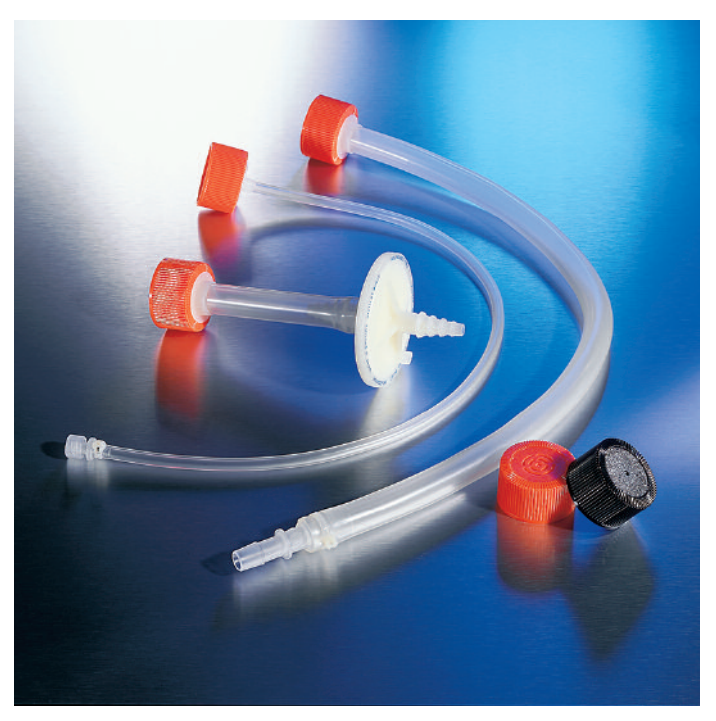
Aseptic Transfer Cap Accessories for CellSTACK Culture Chambers