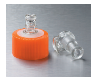
Cat. No. 3339 – Fill cap, male MPC, <sup>3</sup>/8" (9.5 mm) ID with female end cap, sterile Fill cap available with 1/4" (6.4 mm) ID and 3/8" (9.5 mm) ID