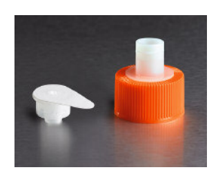
Cat. No. 3332 – Universal Cap, with vented overcap, sterile Designed to fit preexisting filling systems for other product brands.