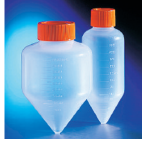
500 and 250 mL Centrifuge Tubes