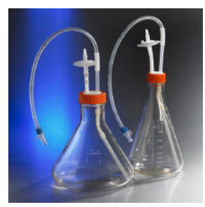
431518 and 431520 Erlenmeyer Flasks for Closed System Solution, MPC