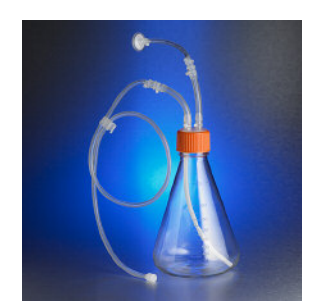
11440 Erlenmeyer Flask with attachment for Luer syringe at the vent.