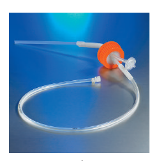
3565, 3562 and 3564 Aseptic Transfer Cap, Luer Lock