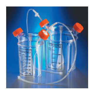
3569, 3579 1L and 3L Disposable Spinner Flasks, Luer Lock