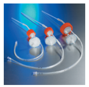
431444, 431446 and 431448 Aseptic Transfer Caps, MLL