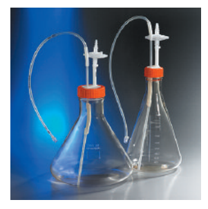
431512 and 431514 Erlenmeyer Flasks for Closed System Solution, MLL