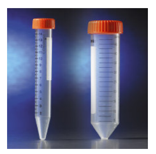
15 mL and 50 mL Centrifuge