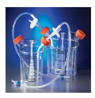
3546, 3559 1L and 3L Disposable Spinner Flasks, MPC Quick Connect