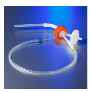
3528, 3545 and 3558 Aseptic Transfer Cap, MPC Quick Connect