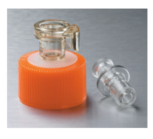
Cat. No. 3328 – Fill cap, female MPC, ½4" (6.4 mm) ID with male end cap, sterile Fill cap available with 1/4" (6.4 mm) ID and 3/8" (9.5 mm) ID