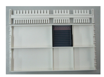
Step 1: Use Nippon Genetics Europe black gel tray to make gel with loading wells