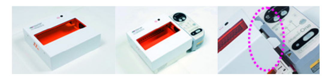
Step 4:Make sure the power safety buttons of Mupid<sup>TM</sup> One have been pressed by the 2 hooks on sidewall of the MUPID<sup>TM</sup> LED Illuminator

Step 5: Plug power line into MUPID<sup>TM</sup> LED Illuminator and Mupid <sup>TM</sup> One